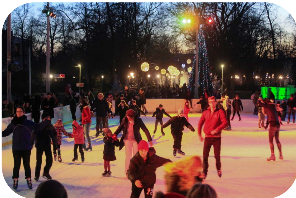
Place Rapp Skating Rink (J.M Hédouin)