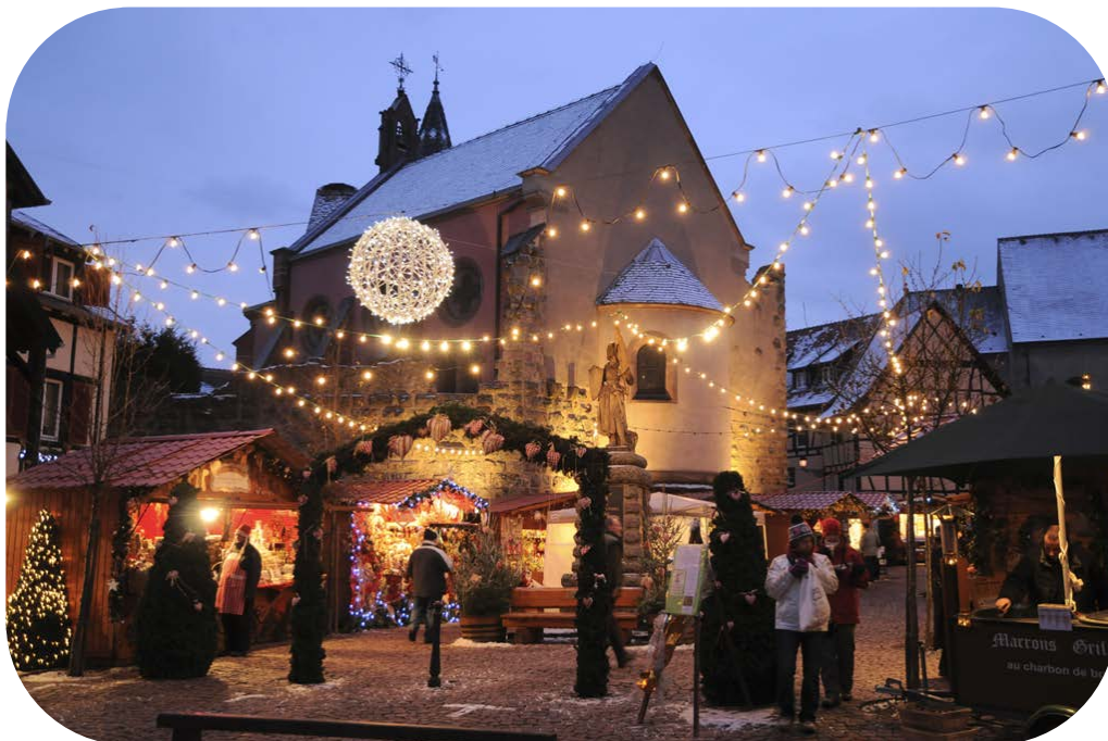
The Eguisheim Christmas Market (C. Dumoulin)

Dates and times of Christmas Shuttles in the Pays des Etoiles on www.navettedenoel.fr