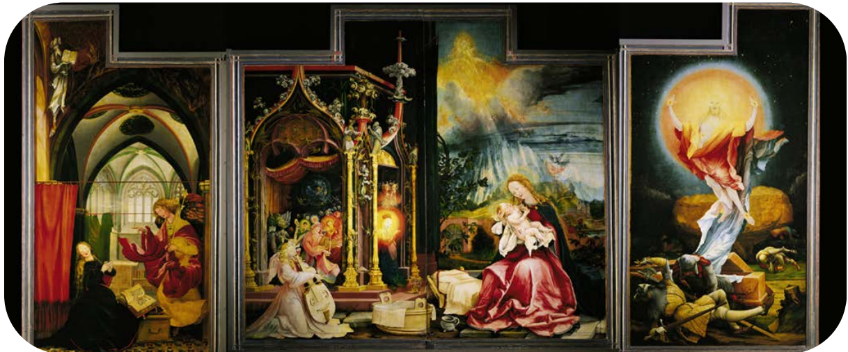
The Isenheim Altarpiece

The Medieval cloister presents the art of the Middle Ages and the Renaissance, with works by the likes of Martin Schongauer, Hans Holbein and Lucas Cranach, as well as the museum's great masterpiece, the Isenheim Altarpiece (1512–1516).