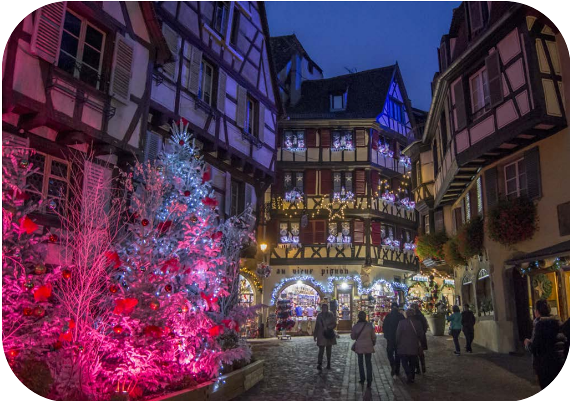
Rue des Marchands (Colmar TO)