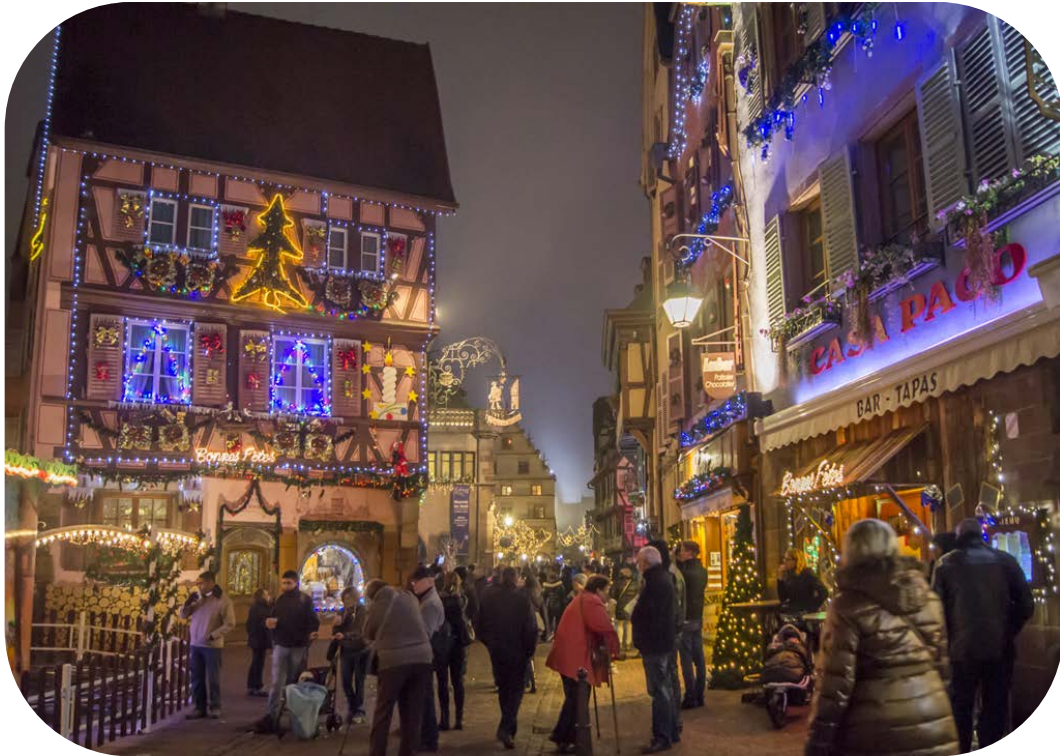
Christmas in Colmar, an authentic atmosphere (Colmar TO)