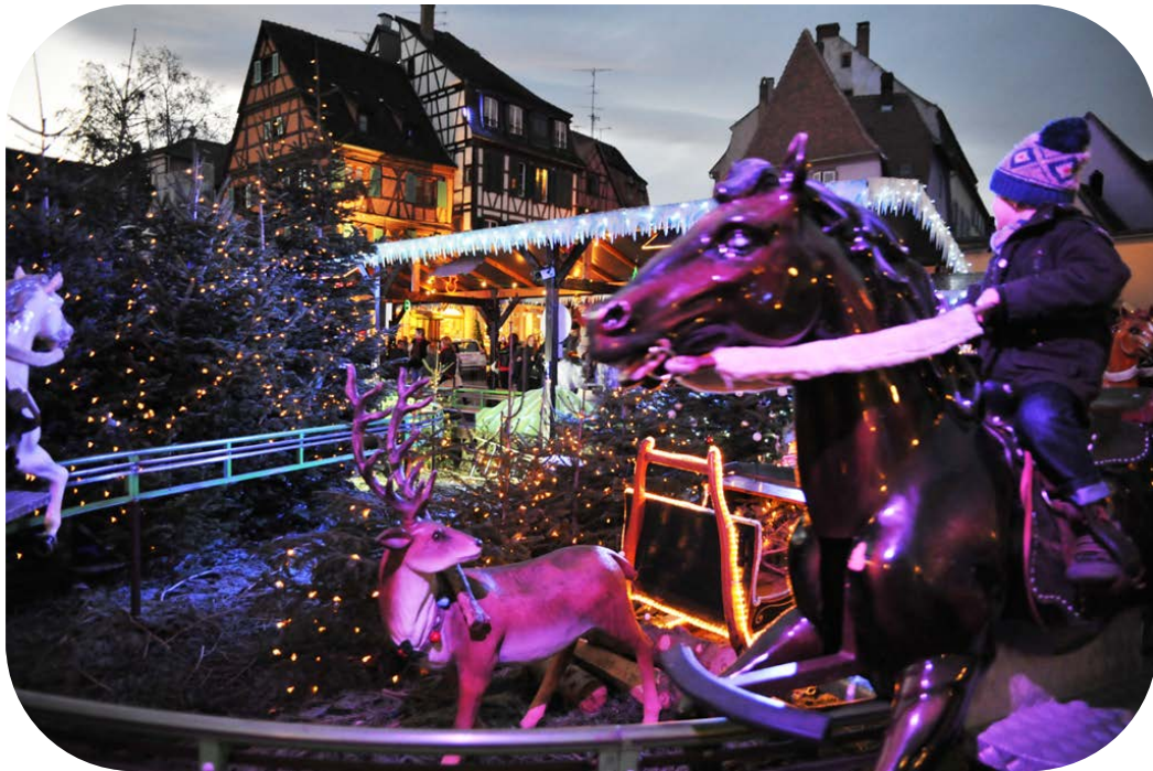
The little horses of the Children's Christmas Market (Colmar TO)