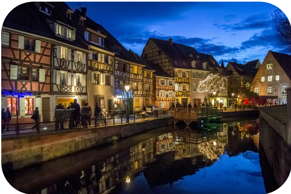
The illuminations of Petite Venise (Colmar TO)

The magic of Christmas in Colmar is also created by the decorations and installations put up by the City, business owners and private individuals, as they compete to be the most creative. Enchanted visitors can simply be guided by the truly cinematographic sights on offer.