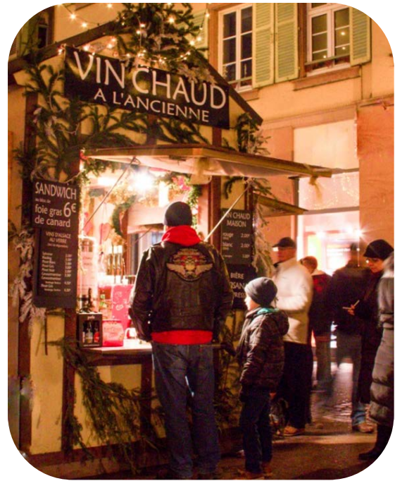
Traditional mulled wine

In the cellars or at the Christmas Markets, come and meet the region's wine producers and sample some extraordinary wines: the famous Alsace whites will seduce you by their elegance and variety, leaving you wanting only one thing: to have them with your festive meals... As for the Crémant d'Alsace, this is the choice for sophisticated fizz.