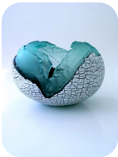
Artwork (P. Lemoine)

Eglise des Dominicains - Place des Dominicains 25/11 to 31/12: