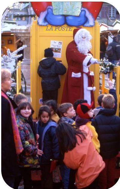
Letter box (B. Naegelen)

Children have their own dedicated Market, on the Place des Six Montagnes Noires, in the heart of the Petite Venise but the surprises don't stop there! The little visitors won't know where to go first there is such a variety of activities in store for them in every part of the city.