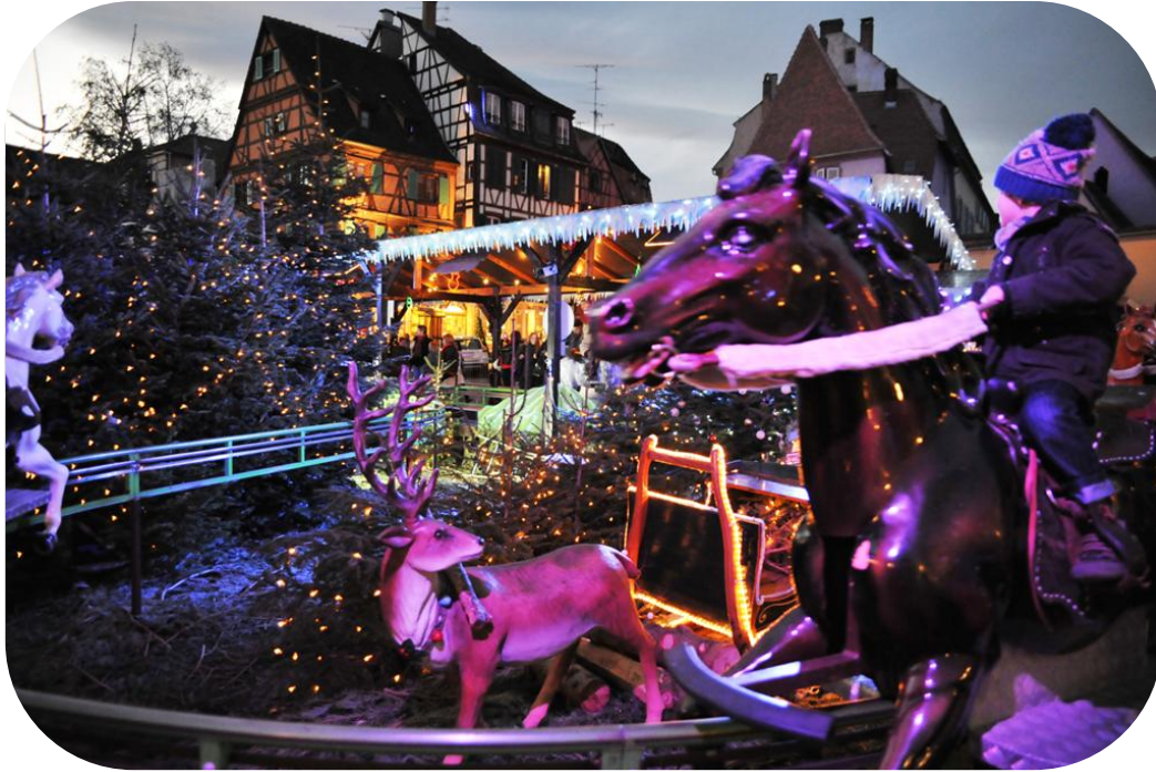
The little horses of the Children's Christmas Market (Colmar TO)