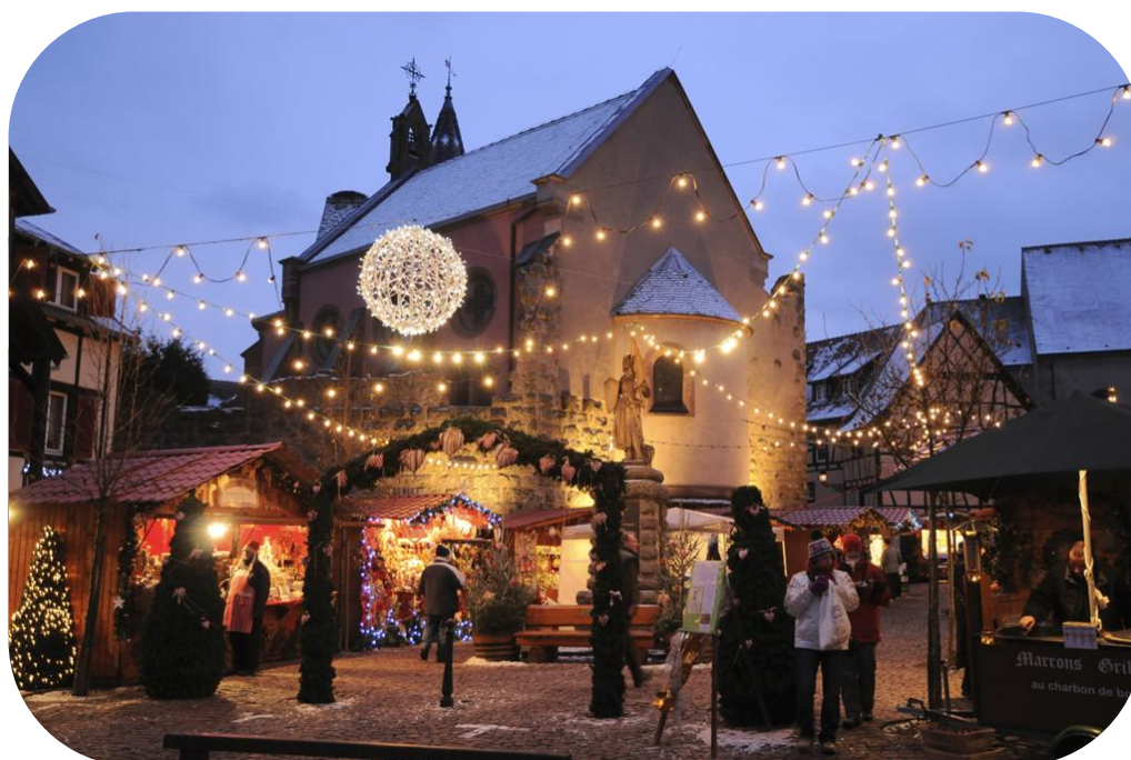
The Eguisheim Christmas Market

Dates and times of Christmas Shuttles in the Pays des Etoiles on www.navettedenoel.fr