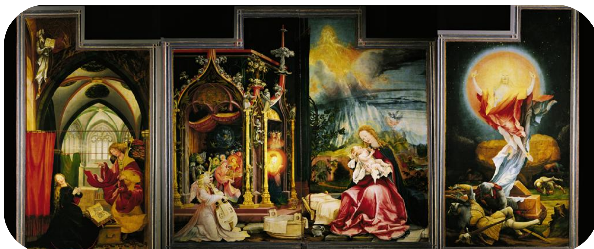
The Issenheim Altarpiece (O. Zimmermann)

In the heart of Old Colmar, an impressive architectural and urban museum project! The Musée Unterlinden, extended and renovated under the guidance of the famous Basel architects Herzog & De Meuron , with the Department of Historic Monuments, is establishing itself as an exceptional site. Here, you can (re)discover the famous Issenheim Altarpiece by Matthias Grünewald , a jewel of Western art, which never ceases to fascinate visitors who come to gaze at it and artists who are inspired by it. The surface area of the museum has been doubled to house a vast collection, ranging from archaeology to modern art, for visitors in search of a profound aesthetic experience.